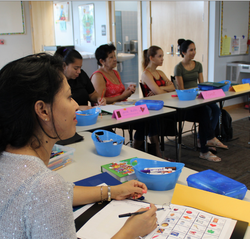
≡ Bright Beginnings adult classroom, parent time

The Bright Beginnings family literacy program has been changing families' lives for over a decade at Grace Place. Together, we've celebrated countless milestones and watched whole-family transformations happen among our students. Now, it is with great pleasure we announce the launch of the Grace Place Family Literacy Model®.