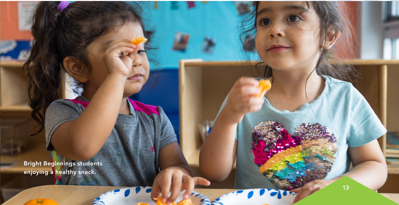
Bright Beginnings students enjoying a healthy snack.