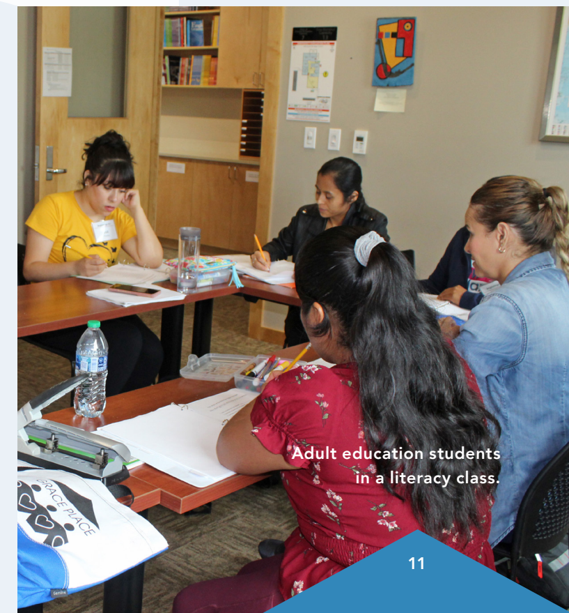
Adult education students in a literacy class.

110 adult education students returning from last year.