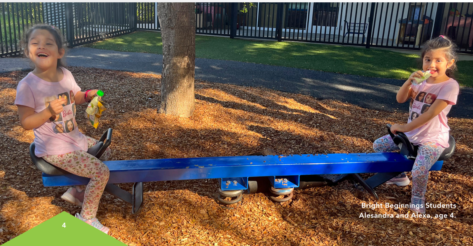
Bright Beginnings Students Alesandra and Alexa, age 4.

100% ▶ of 4-year-olds at Grace Place were developmentally ready for kindergarten.