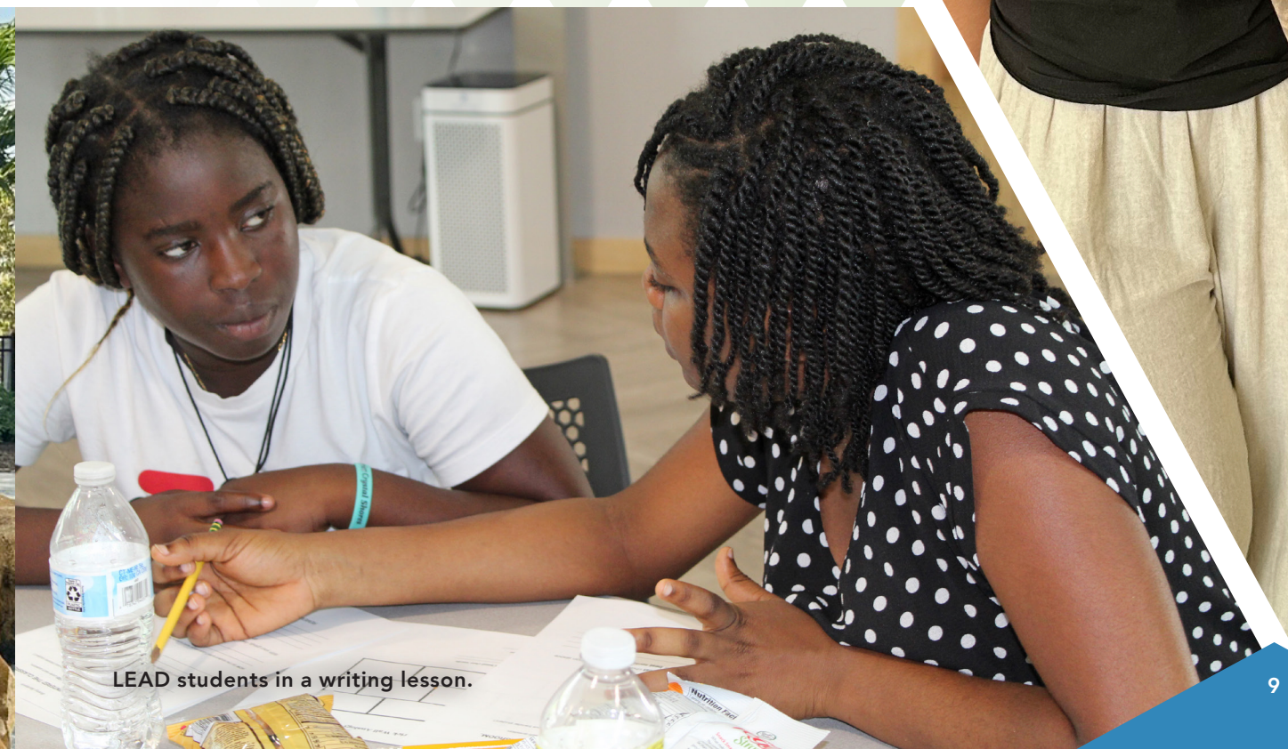
LEAD students in a writing lesson.